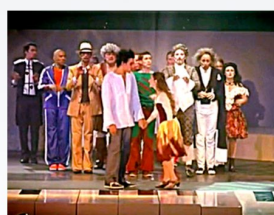
Musical Piano Plage Paris, France 🇫🇷 - 2014