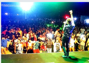
Festival Regata Pontal de Maçêio, Brazil 🇧🇷 - 2014