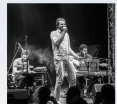
Budgetless Cover Live Tel Aviv, Israel 🇮🇱 - 2016