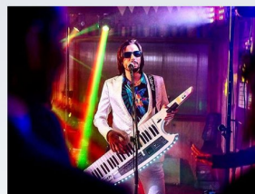
Miami Vibe 80s Band Cardigan, Wales, UK 🇬🇧 - 2020