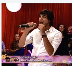
TV Diario "Ao Vivo" Fortaleza, Brazil 🇧🇷 - 2015