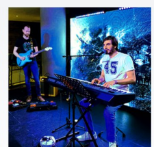
Club Med Artist Show Pragelatto, Italy 🇮🇹 - 2019