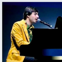
Golden Jalia Awards Rabat, Morocco 🇲🇦 - 2019