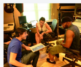
Mixdown Studio New York, USA 🇺🇸 - 2013