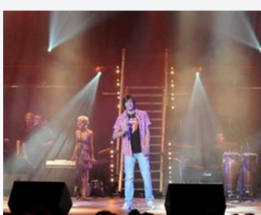
StarAc' contest Brussels, Belgium 🇧🇪 - 2009